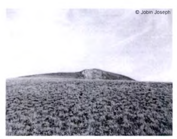
Image 3. The view of the habitat of Raorchestes resplendens at Poovar, Eravikulam National Park

Journal of Threatened Taxa | www.threatenedtaxa.org | September 2012 | 4111 3082-3084