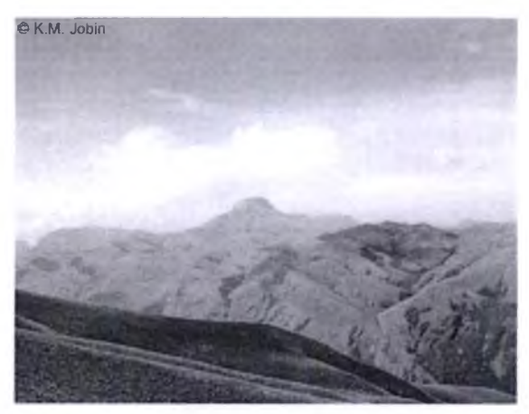
Image 2. The view of Anamudi peak, from the Poovar, in Eravikulam National Park

Raorchestes resplendens is a brightly coloured frog (Images 4 & 5), with reddish-orange upper side, including the dorsal parts of limbs, fingers and toes. The groin and inner side of the thighs are black, ventral