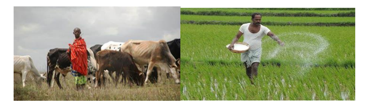
Figure 3. A Maasai pastoralist