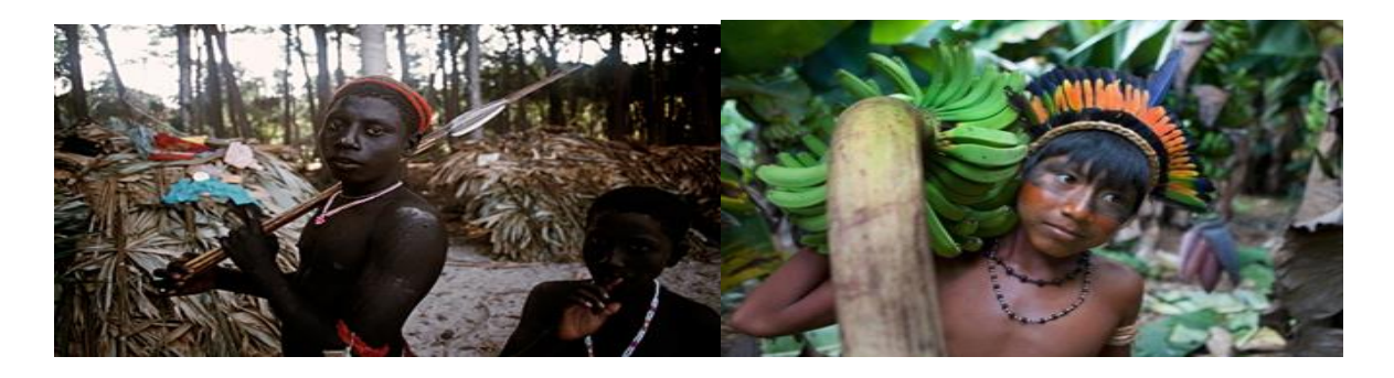
Figure 1. A Jarawa forager