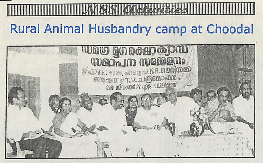
Smt. K.R. Gouri Amma, Minister for Agriculture participates in the valedictory function of the Integrated Animal Husbandry camp at Choondal.

An Integrated Animal Husbandry Camp envisaged to collect information and study obtained data on the status of animal husbandry activities was conducted in the Choodal Grama Panchayat, with the participation of the National Service Scheme, College of Veterinary and Animal Sciences, Communication Centre, KAU, the state department of Animal Husbandry and the Grama Panchayat.