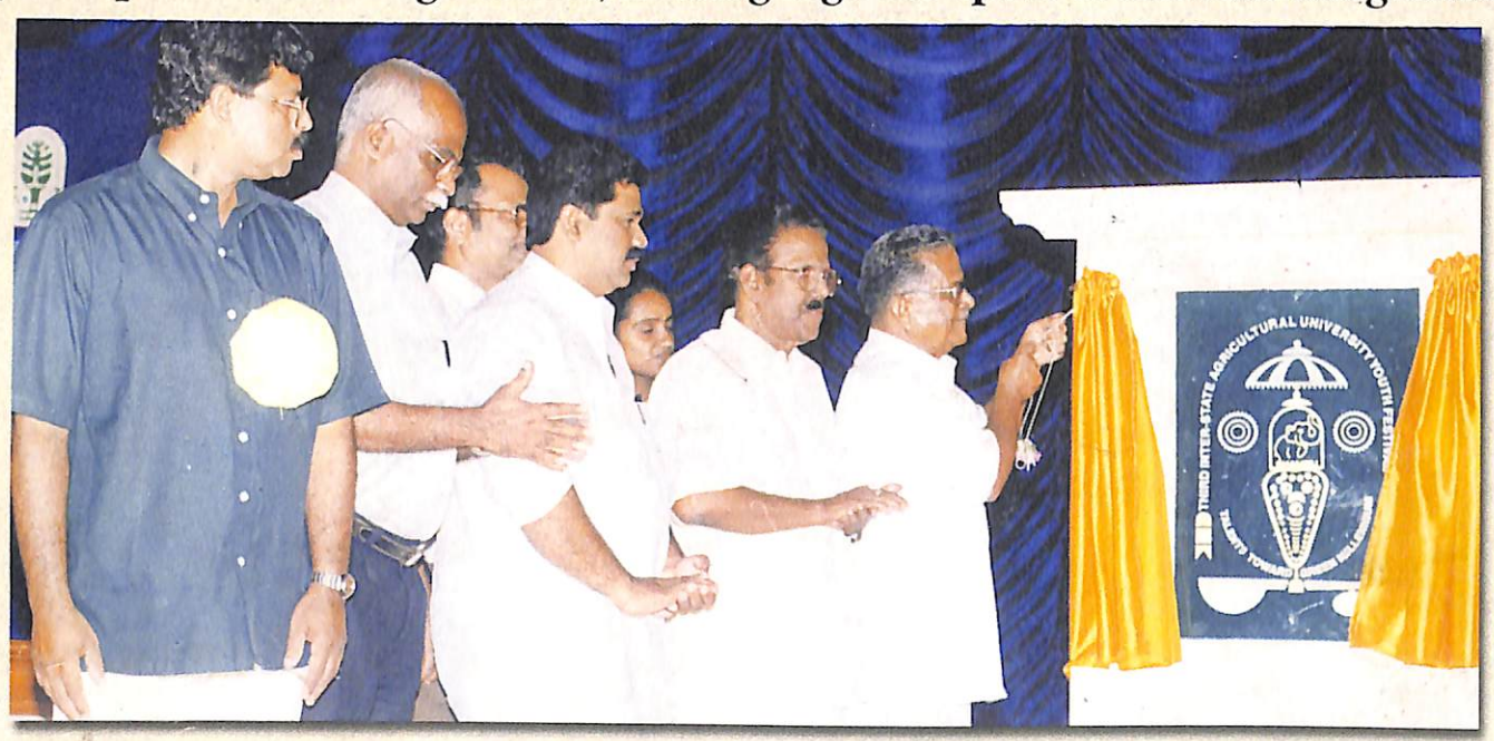
Shri. V.V. Raghavan M.P. unveils the festival mascot of the Agriunifest - 2001

The third All India Inter-state Agricultural University Youth Festival sponsored by the Indian Council of Agricultural Research was hosted by the Kerala Agricultural University, Thrissur from January 21-25, 2002. Tweleve Agricultural Universities participated in the megafestival, holding high the spirit of national integration.