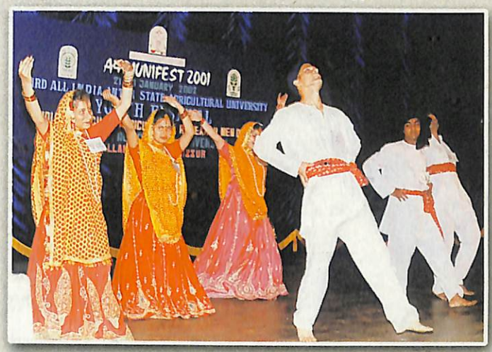
GB Pant University of Agriculture & Technology: Rejoicing on Harela