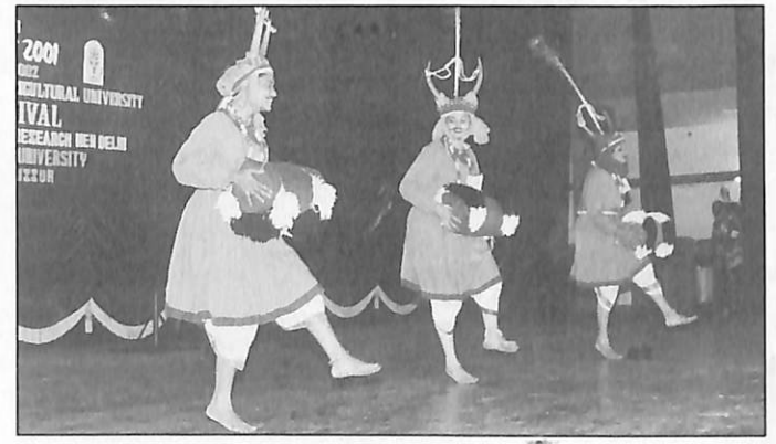
Folk dance depicting yet another culture