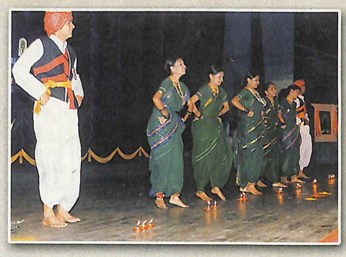
Energetic steps to express the energy of Maharastrian: Folk dance of the Marathwada Agricultural University which bagged the First Prize