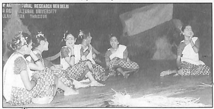
The joy of barvest in Kerala