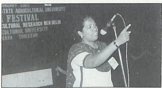
A participant from the Mahatma Phule Krishi Viswa Vidyalaya, Raburi