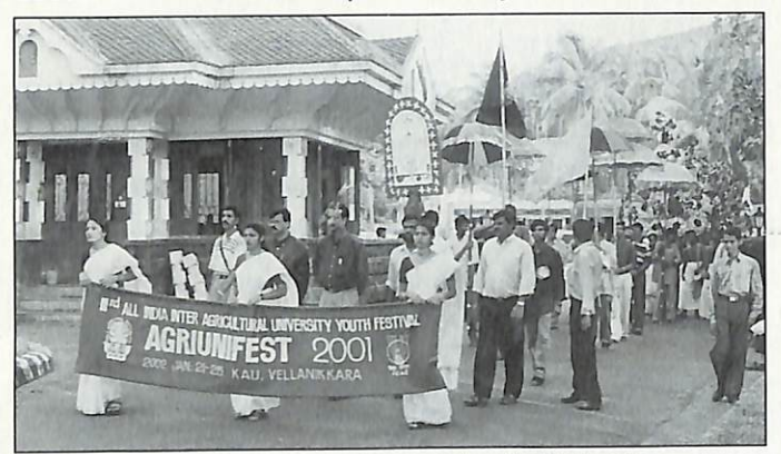
National integration procession entering the KAU main campus

The third All India Inter-state Agricultural University Youth Festival (AGRIUNIFEST - 2001) was held at the Kerala Agricultural University (KAU) Thrissur during Jan. 21-25, 2002. The festival was sponsored by the Indian Council