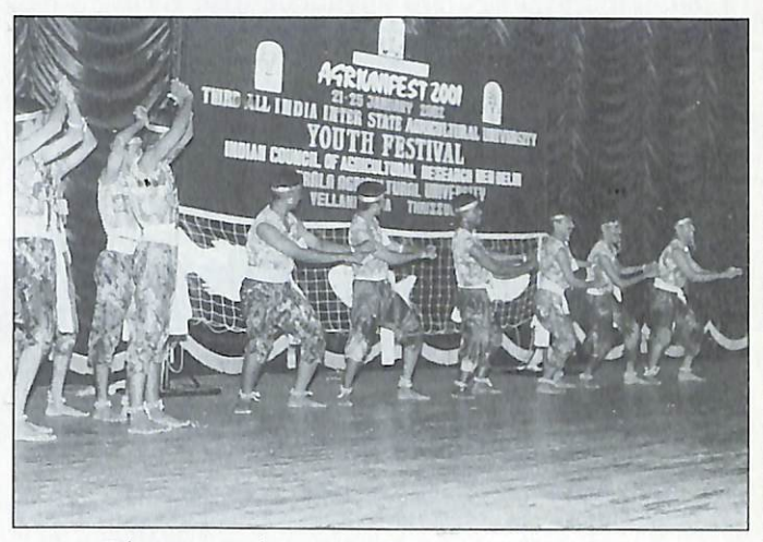
Fishermen on work: University of Agricultural Sciences, Dharwad

The folk dance of the Tamil Nadu Agricultural University portrayed the Dravidan culture of pleasing gods by way of human sacrifice.