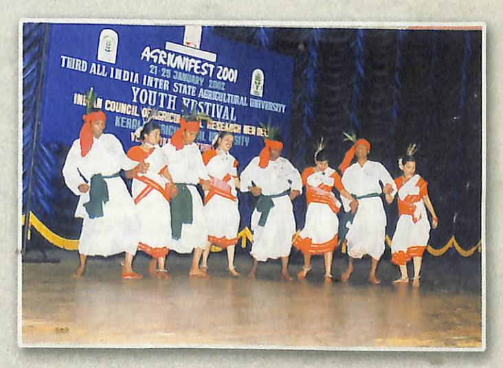
Jhoomar dance of Birsa Agricultural University