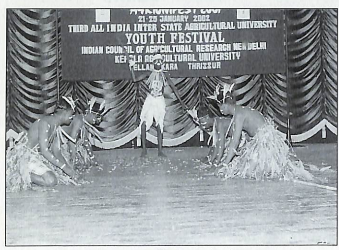
The folk dance of Tamil Nadu Agricultural University

The people of India have embraced different religions, speak many languages and follow peculiar customs and traditions. All these are reflected in our art, music, dance, festivals and lifestyles.