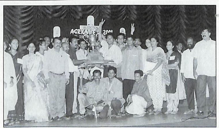
The KAU Team with the Rolling Trophy for overall championship