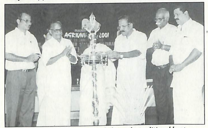
The inaugural function by lighting the traditional lamp

of Agricultural Research (ICAR), New Delhi. An organising Committee, eighteen sub-committees and a 'Jury of Appeal' were constituted for the smooth conduct