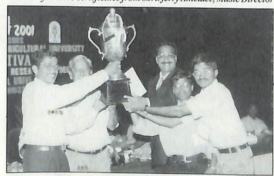
The Orissa University of Agriculture and Technology - the best disciplined team receives trophy