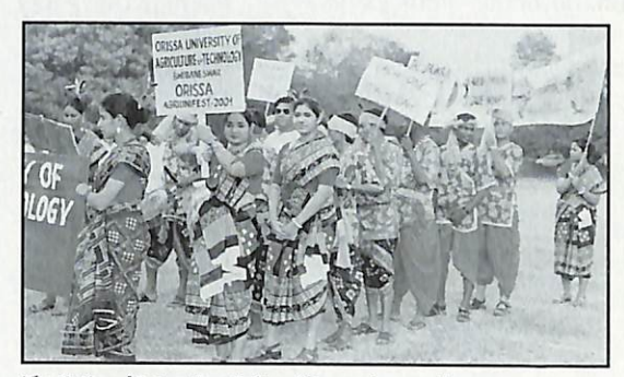
The National Intgration Cultural Procession marks the begining of the Agriunifest

was secured by the Assam Agricultual University, Jorhat with 63 points. The overall championship was bagged by the Kerala Agricultural University scoring 66 points. The festival curtains came down with the cultural programmes staged by all the participating teams bringing unity in diversity and with expectation to meet again at the G.B. Pant University of Agriculture and Technology, Pantnagar, for the fourth festival.