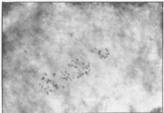
Fig.3 Metaphase 1 in S-10 showing 66 bivalents (x 4000)

Distribution of chromosomes to the poles was equal at anaphase II, normal tetrads having four microspores were formed by all the PMCs at the end of meiosis. All the lines recorded more than 98 per cent pollen stainability.