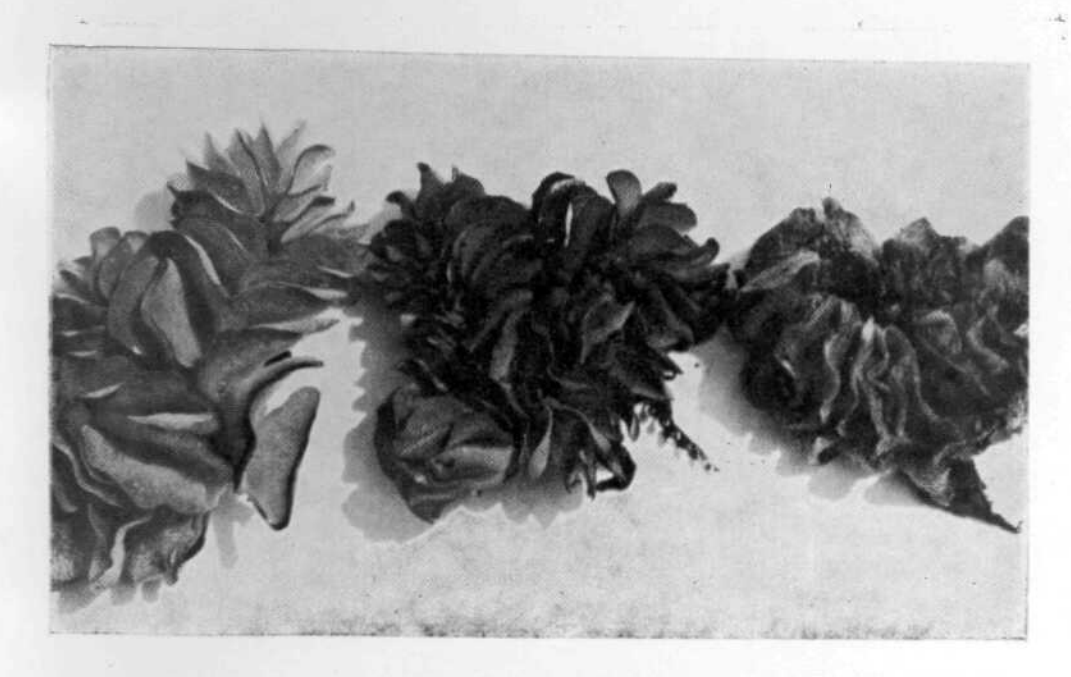
Fig. 1 Browning of salvinia due to Cyrtobagous weevil infestation