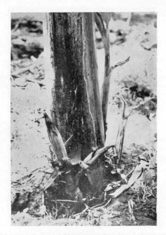
Fig. 1 Abnormal branching of inflorescence in banana var. Palayamkodan