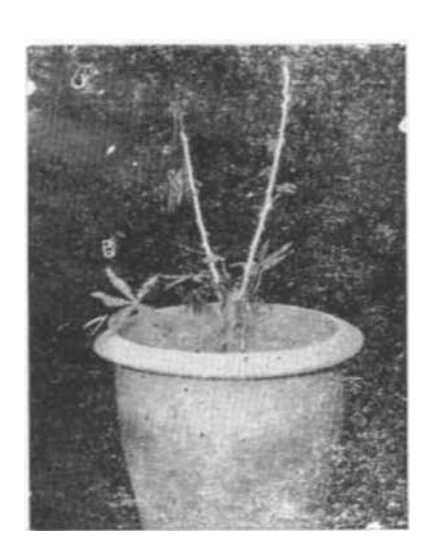
Fig. 4 Development of new sprouts from the base of the affected stem—note the "Candle-symptoms"