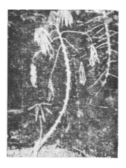
Fig. 1 Early symptoms of Cassava blight