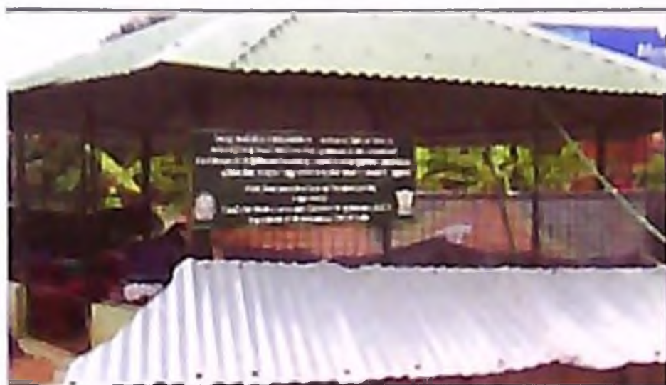
Women run vermicompost business unit, Mannuthy, Thrissur