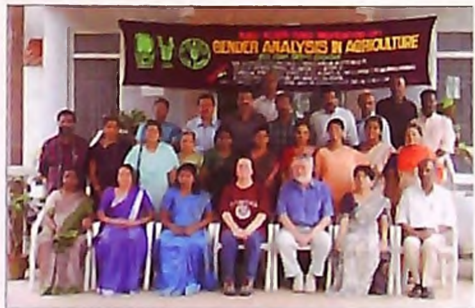
Participants of the International Course on Socio Economic and Gender Analysis