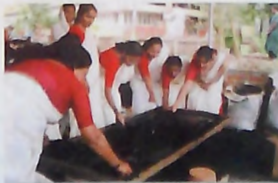
Technological empowerment for farm women