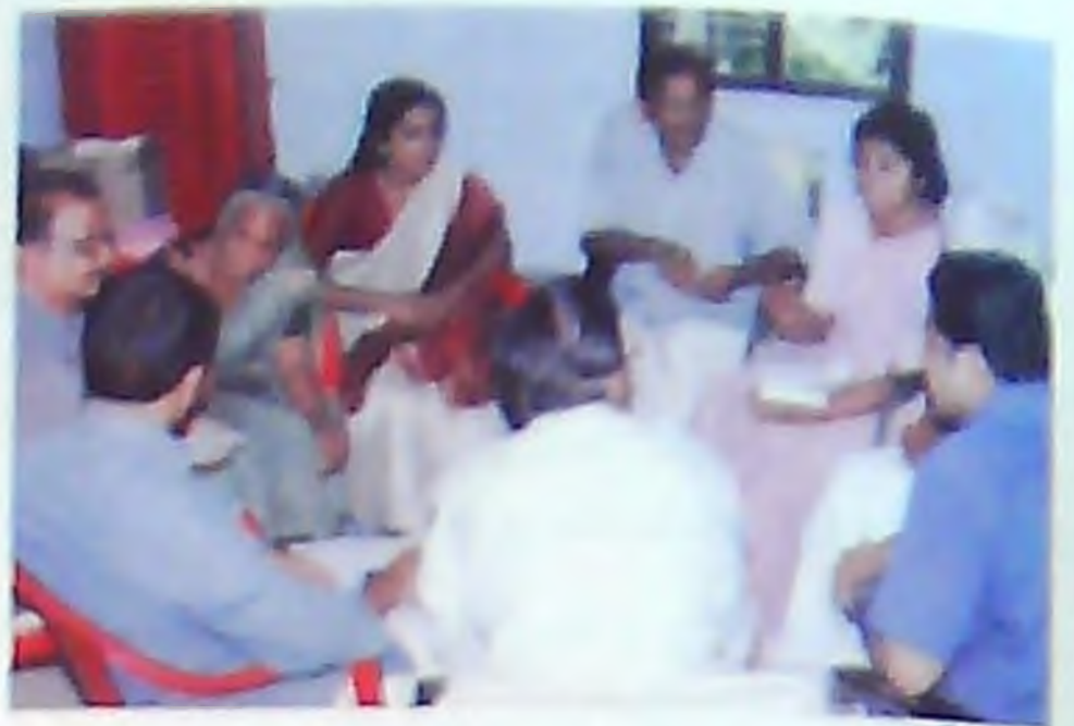
Participatory analysis of farm women's needs and constraints