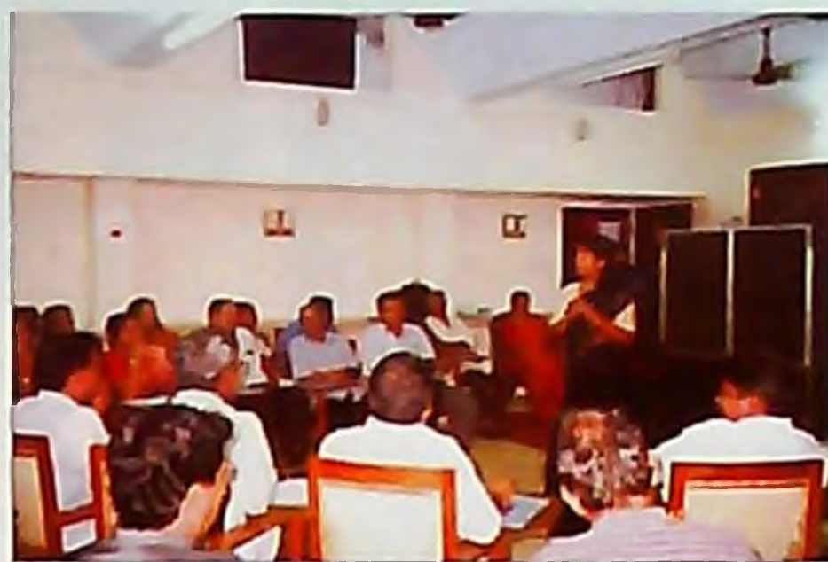
Capacity building programmes for development agencies