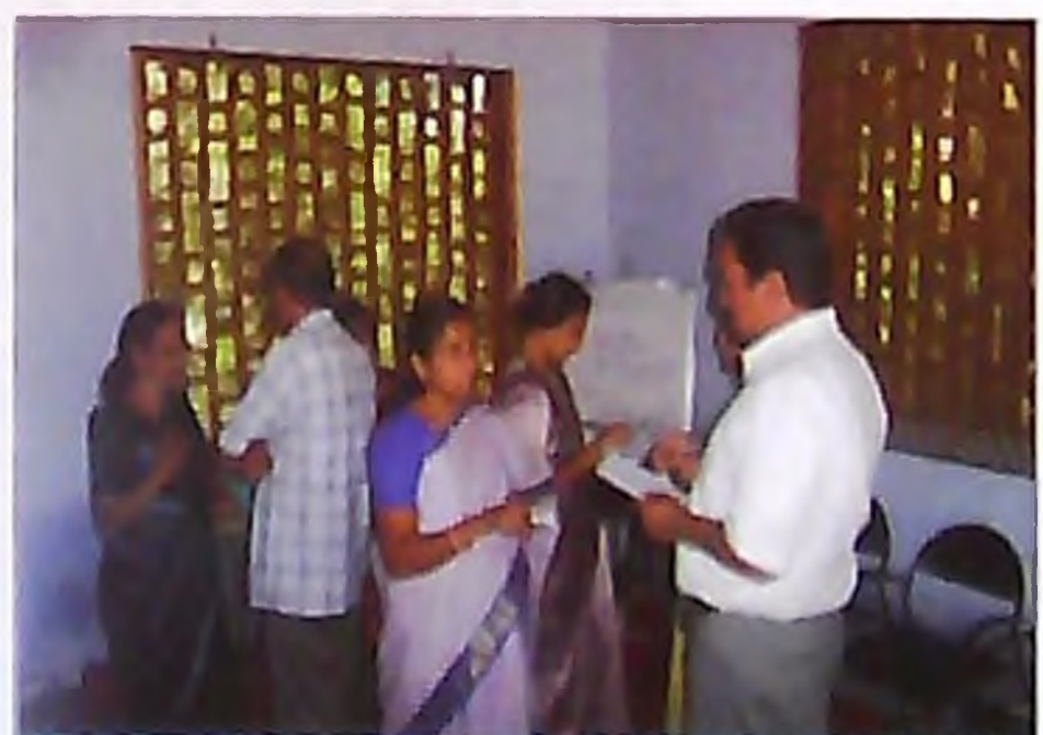
Scenes from the follow up workshop on International Course on Socio Economic and Gender Analysis