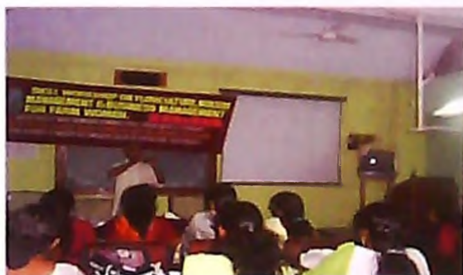
Workshops for farm women on skill and entrepreneurship development