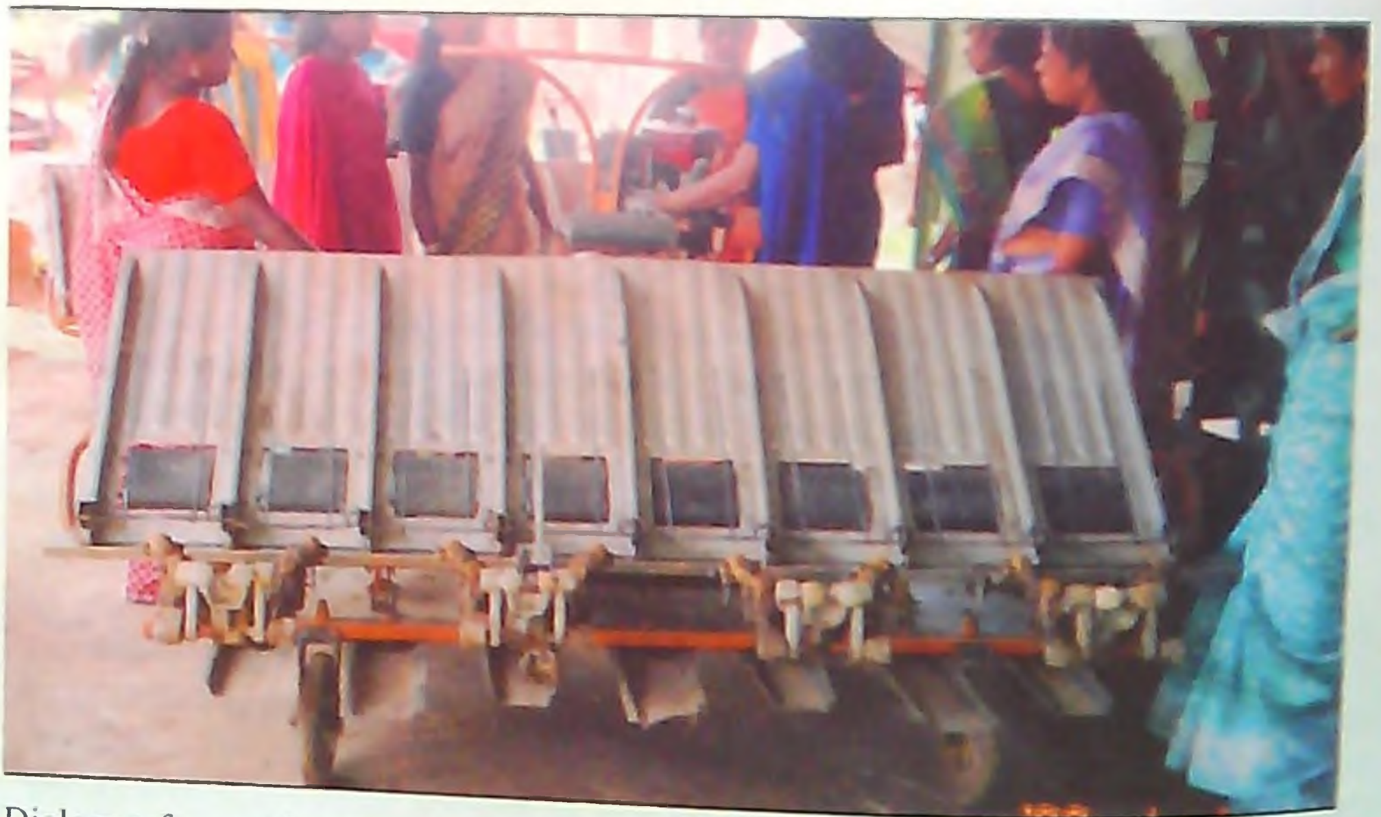
Dialogue for making farm technologies appropriate and accessible to farm women