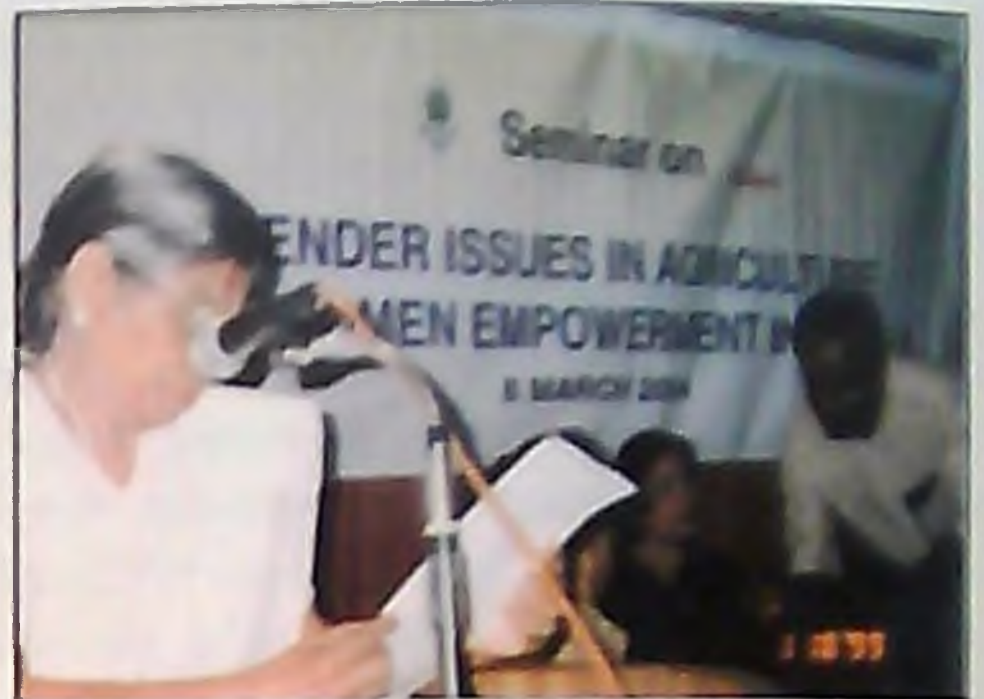
Important personalities presenting views in policy formulation discussions