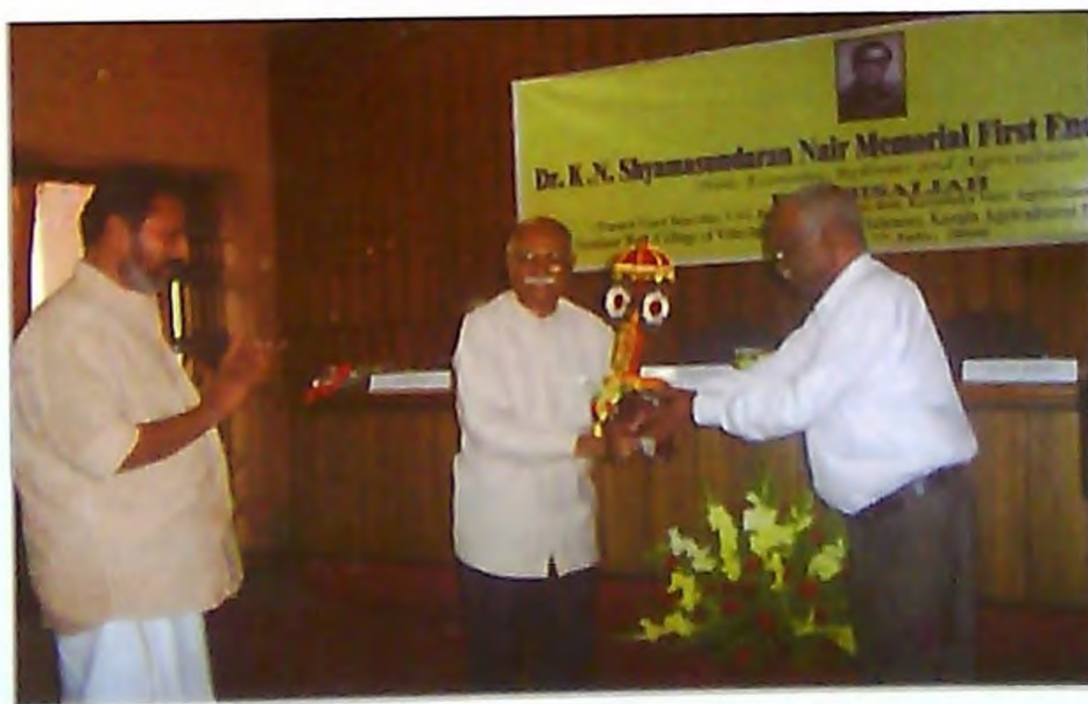
Events of the First Lecture of the Dr. K.N. Shyamasundaran Nair Memorial Endowment