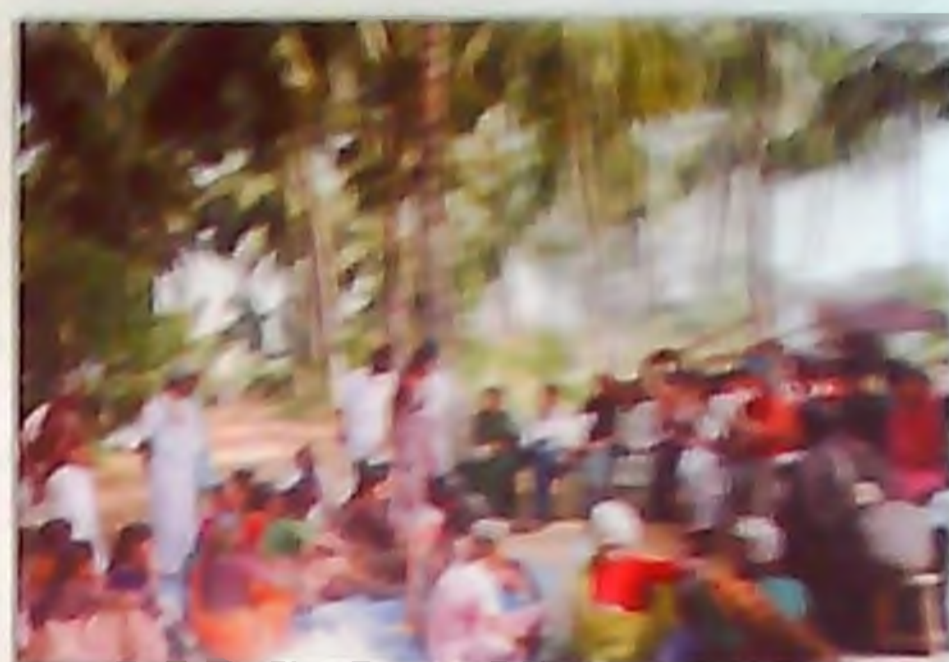
Training for Facilitators of Women in Agriculture Programme of North Eastern States