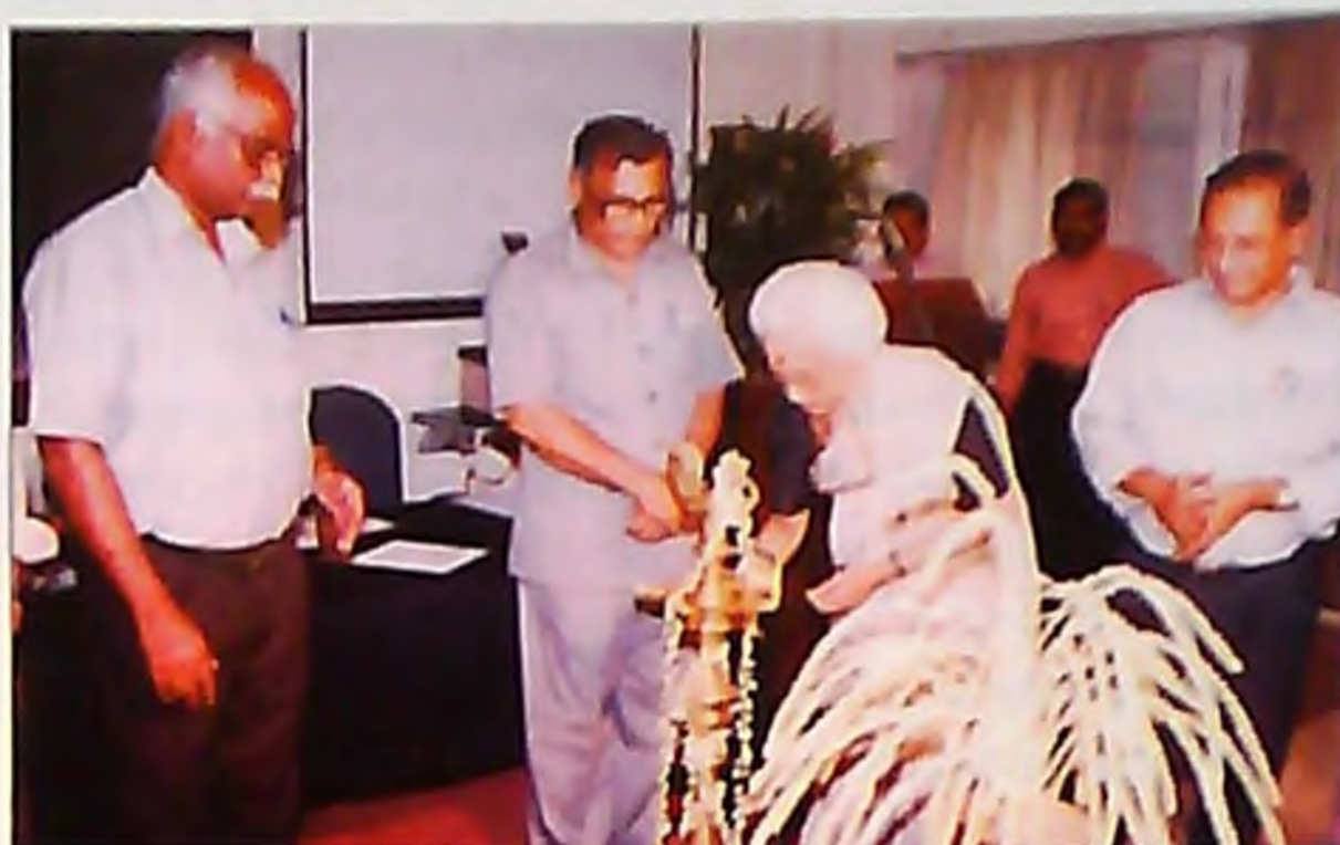
Inauguration of the Centre for Studies on Gender Concerns in Agriculture

KAU. The unique activities thus got initiated from the CSGCA among farmers, labourers, development workers, scientists, students and decision makers of agricultural development towards attaining gender justice in sustainable development had become the pioneering efforts of its kind in the whole nation. In appreciation of the visibility and the impact of the various effect of CSGCA within a short spell, the University took a decision to establish the Centre as a full fledged independent unit during 2000-2001. During 2002-2003, the CSGCA could emerge as a separate establishment under the Directorate of Research of KAU, with an independent office in the Vellanikkara campus of the university.