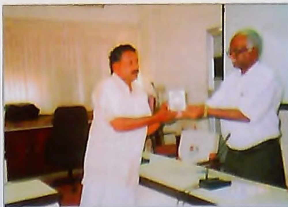
Release of "Unheard Voices"