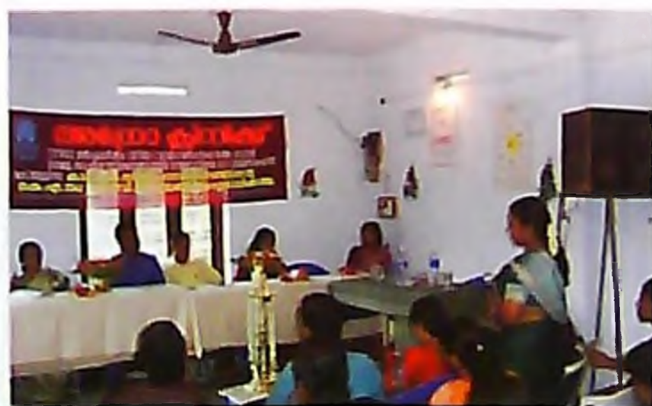
Agroclinics for promotion of farm women entrepreneurs