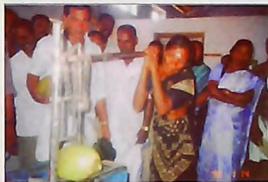
Gender sensitisation and empowerment programmes for KAU staff and workers