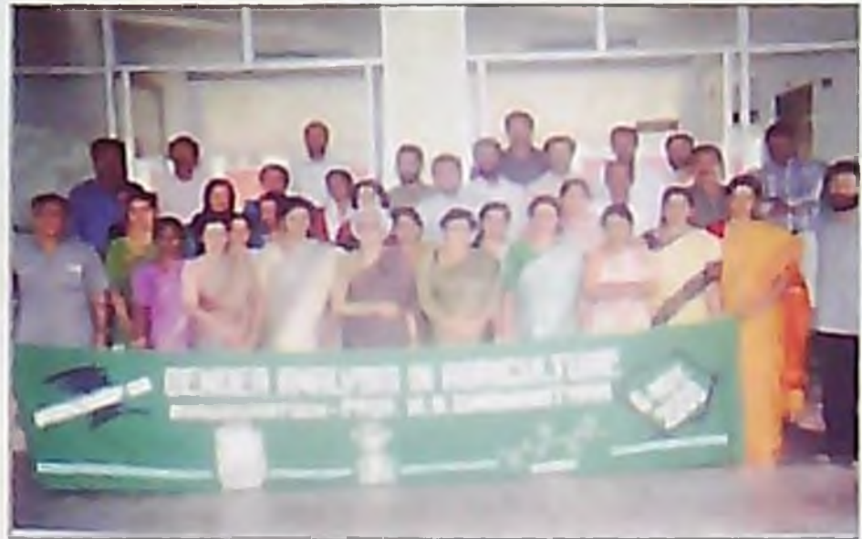
Inaugural function and participants of the workshop on "Gender Analysis in Agriculture"