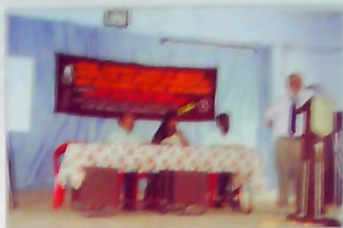
Model Training course jointly organised by FAO and CSGCA