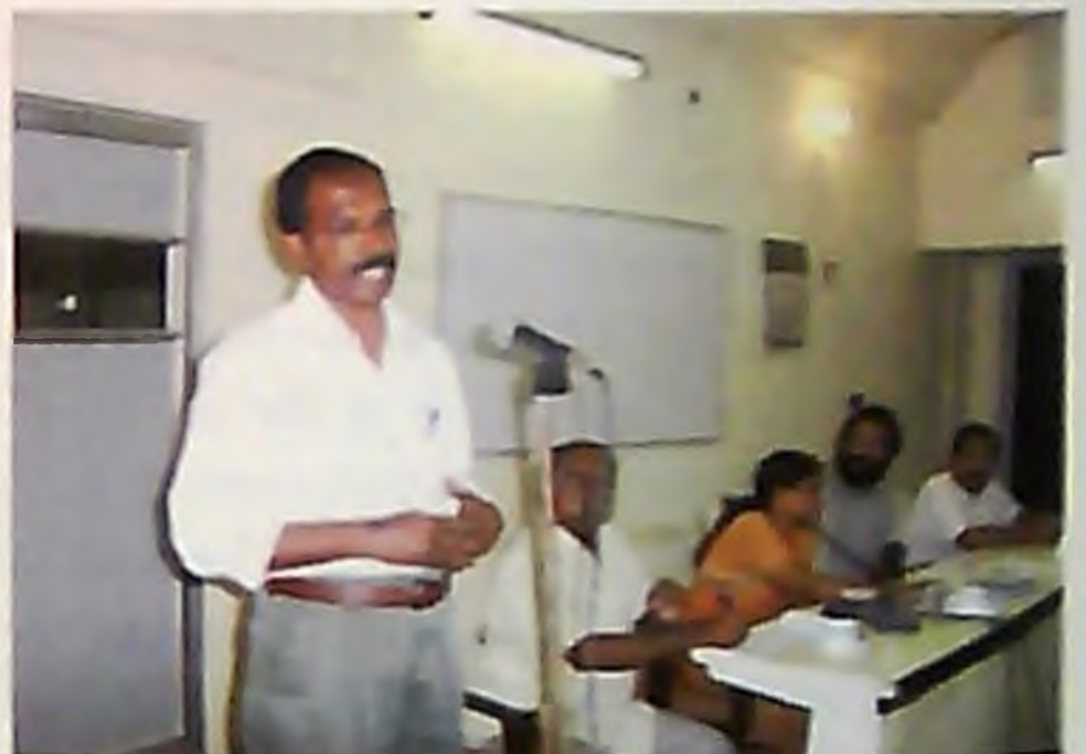
Convergence of different development agencies and stakeholders