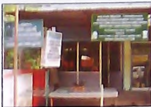
Women run flower business unit, Perinjanam, Thrissur