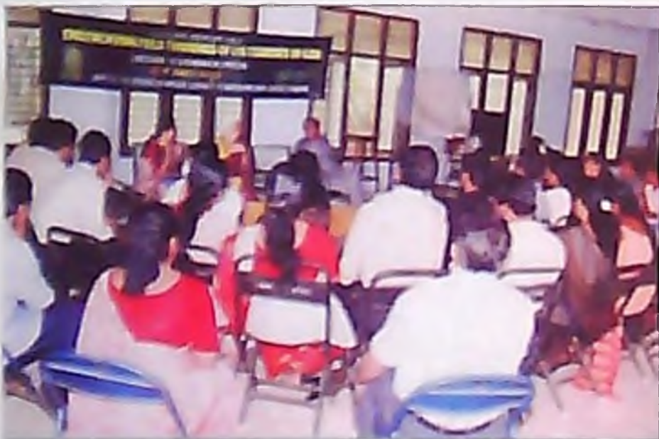
Interactive session of workshop on engendering UG curriculum