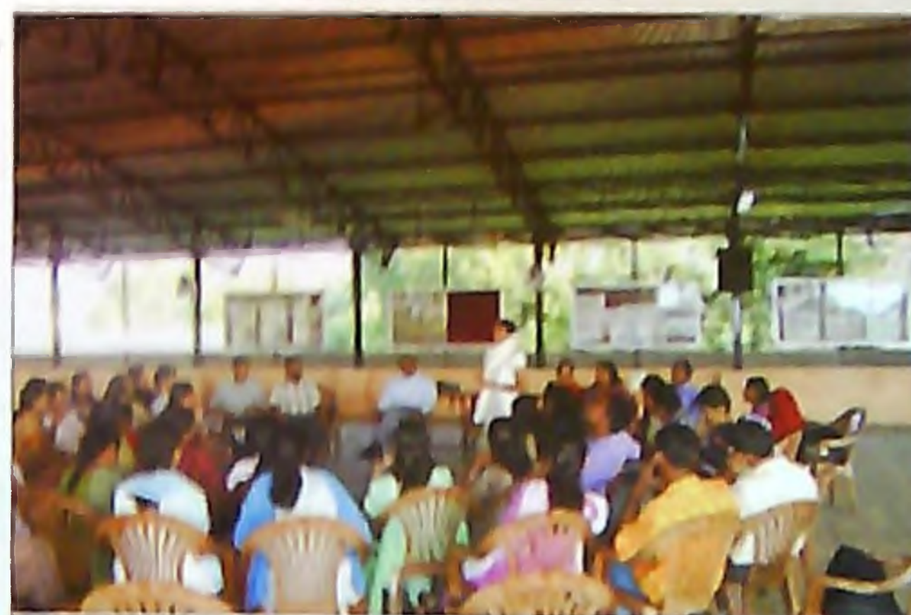
Interactive Session with the students of KAU