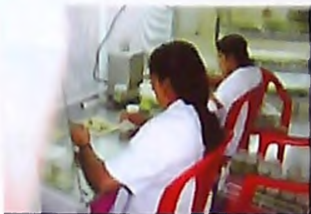
Women run tissue culture laboratory, Nattikka, Thrissur