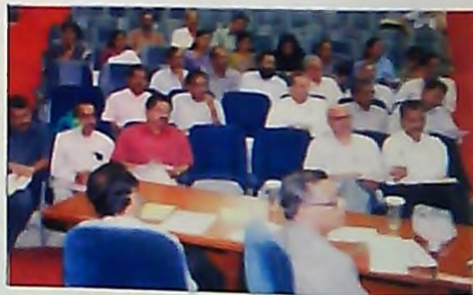
Scenes from the high level discussions for including Gender Perspectives in Agricultural Curriculum