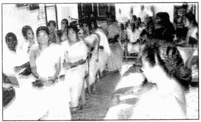
Empowering farm women in mushroom cultivation