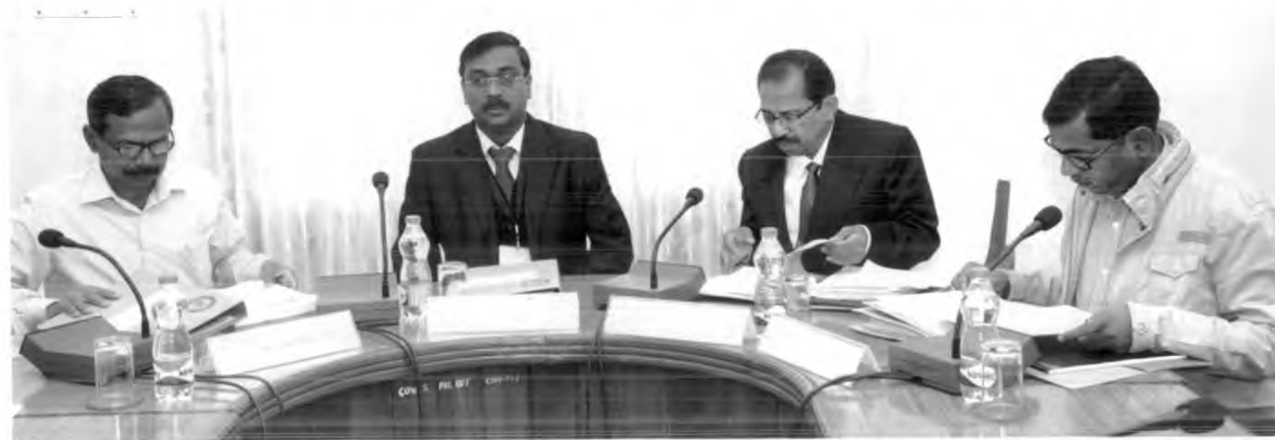
Visit by Veterinary Council of India Inspection Team