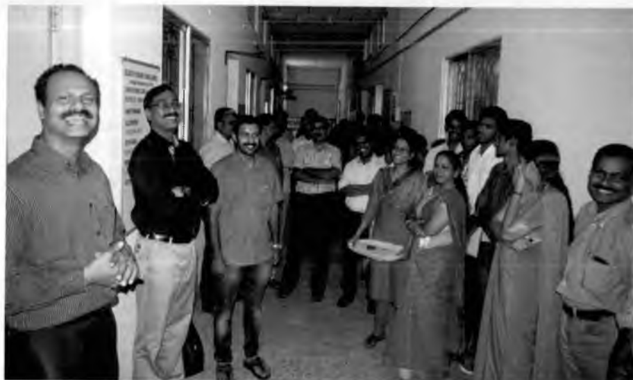
Inauguration of Wellness Clinic