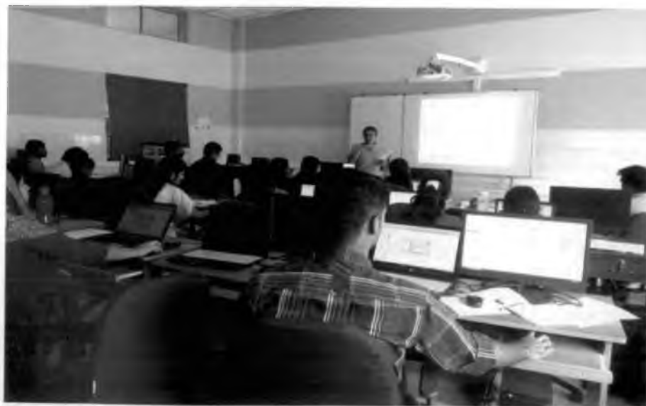
State - of- the Art ARIS Cell