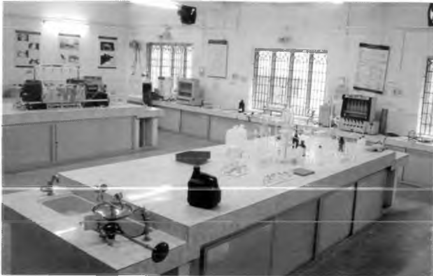
ry NABL accredited Feed and Fodder Laboratory- Animal Nutrition