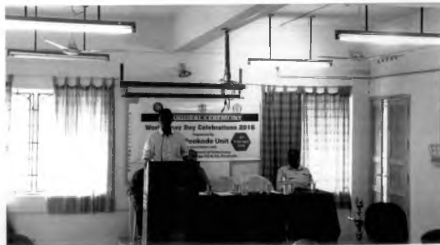
World Spay Day - NSS unit