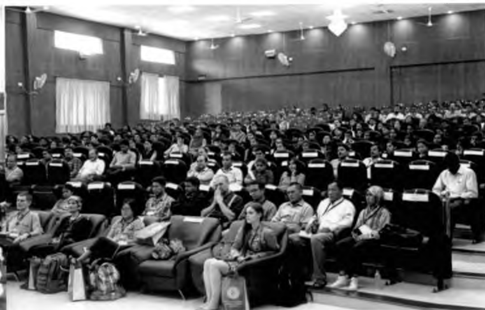
Inaugural ceremony of Regional Asian Elephant and Tiger Veterinary Workshop