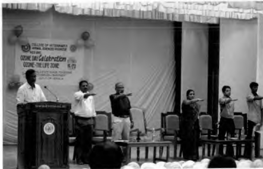
World Ozone Day Celebrations - NSS unit