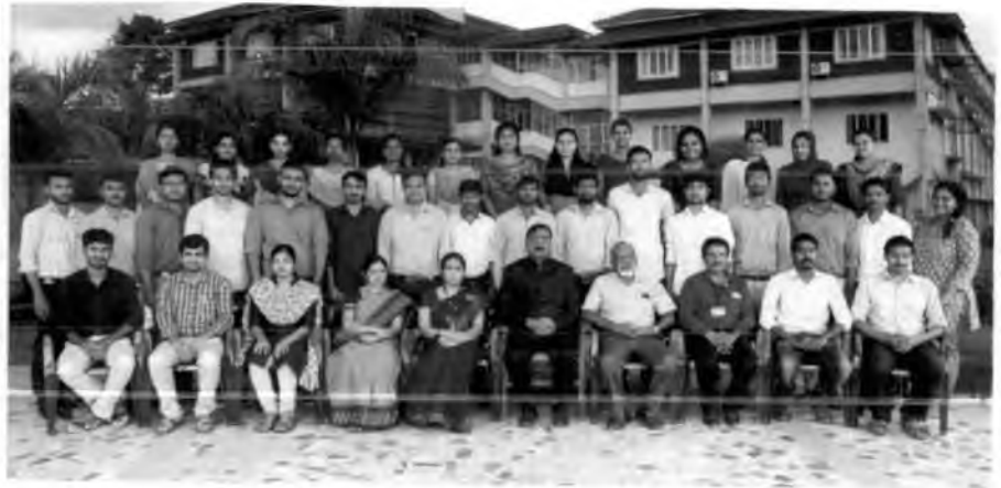
Dean with PG Students