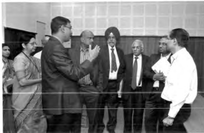
Visit by ICAR Peer Review Team