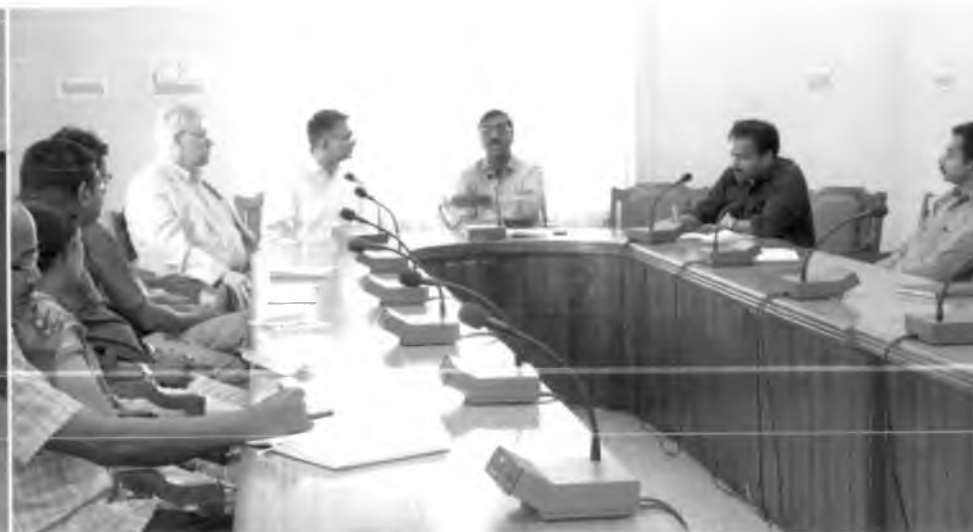
Interaction with Scientists from Pennsylvania State University