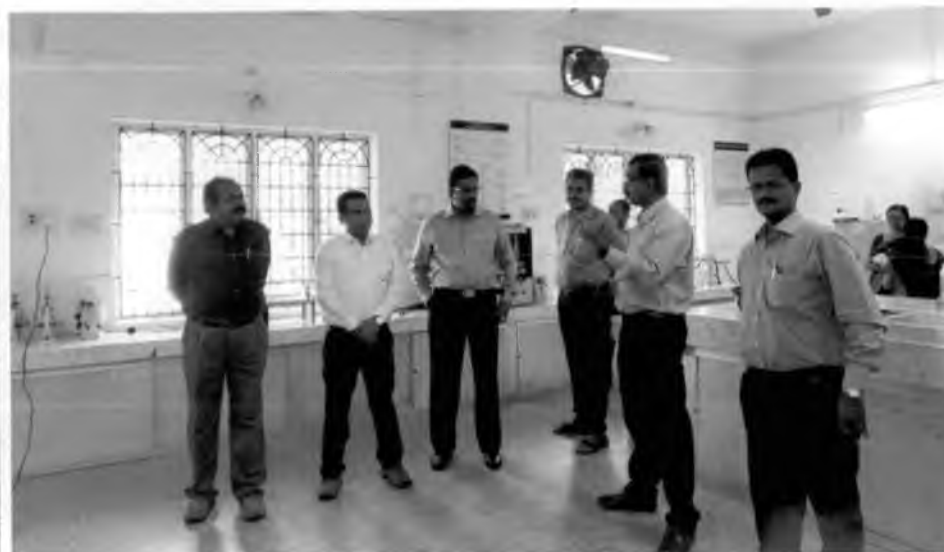
Dignitaries from BRNS & PCK