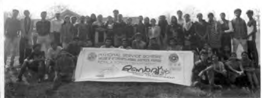
Unarvuu - NSS Nature / Tribal Camp