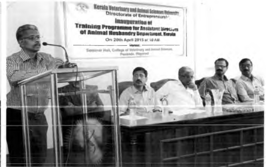
Inauguration of Three Months Training Programme for Assistant Directors of AHD, Kerala