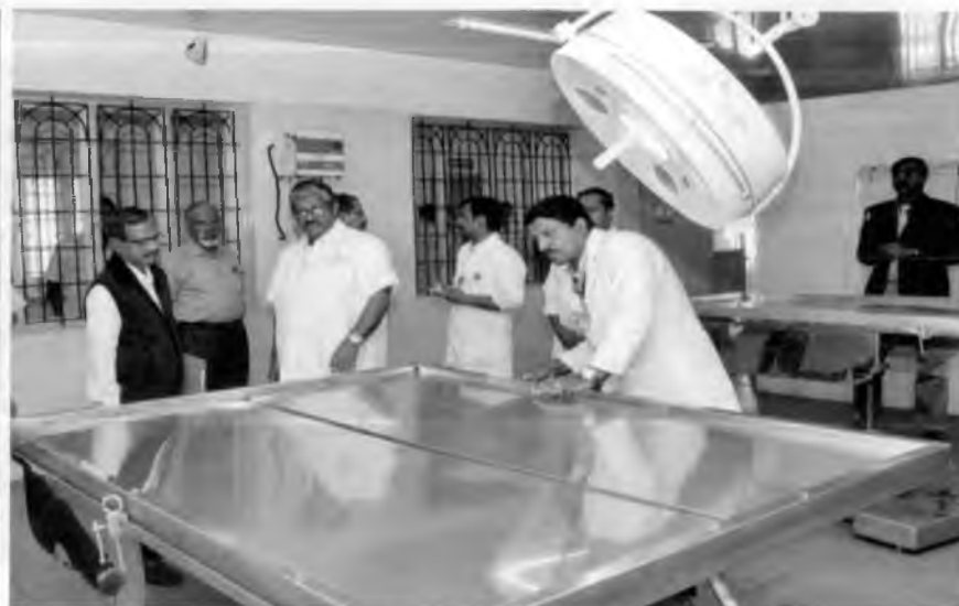
Large Animal Operation Theatre