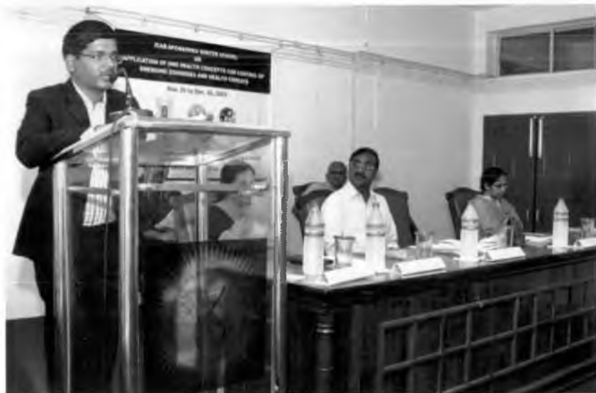
ICAR Sponsored 21 days Winter School