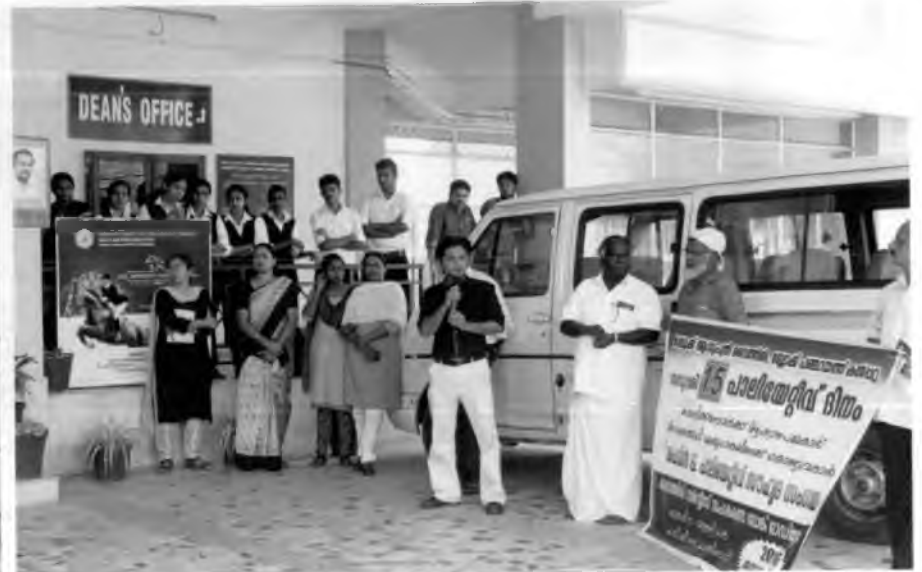
Pain and Palliative day - NSS unit