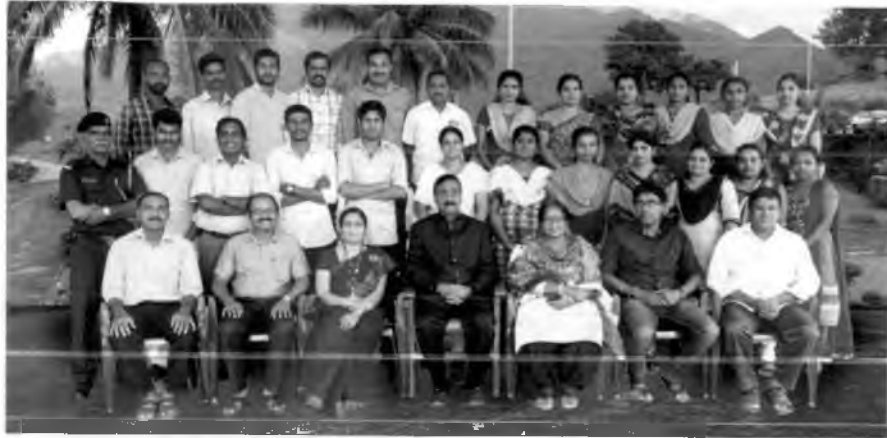
Dean with Administrative Staff