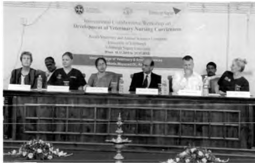
Inauguration of International Workshop on Veterinary Nursing