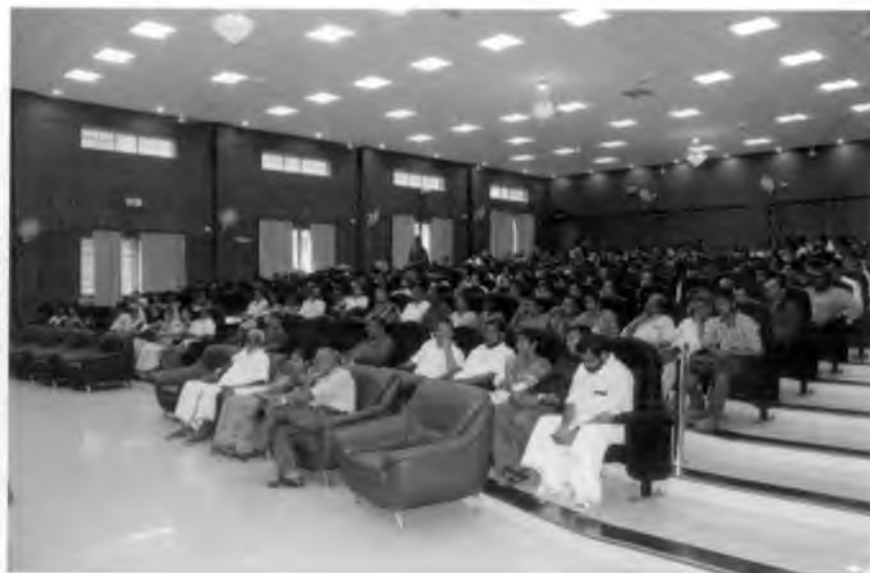
Parent Teachers Association Meeting