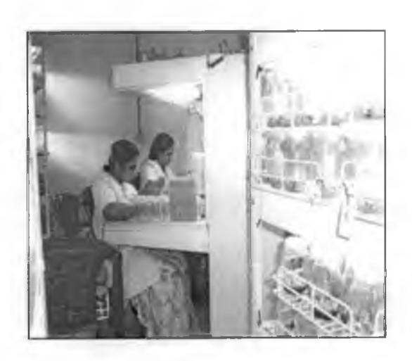
3 ABARD Vanitha Vermicomposting unit, Mannuthy

This group was set up in December 2000 with seven members. This unit is engaged in the production and sale of vermicompost on commercial basis in Mannuthy. This group was supported to develop as a demonstration cum sale point with a small vermicomposting shed from the support of the DBT project. This unit was supported with training and value addition expertise. Photo blowups of women friendly technologies are also set up in this unit. The unit was also supported with biogas unit and quail rearing agencies. Large numbers of visitors to KAU campus are served with this on site demonstration of vermicomposting unit and various