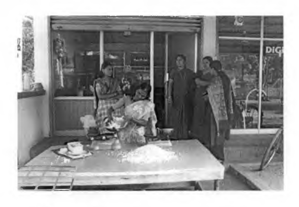
Perinjanam Vanitha Flower Society