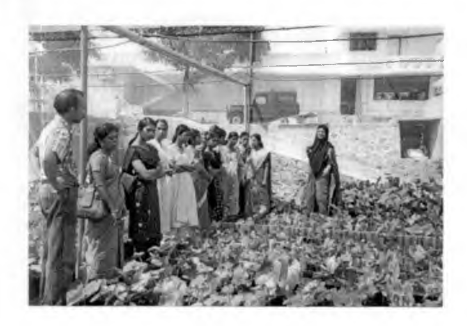
Training on tissue culture and floriculture