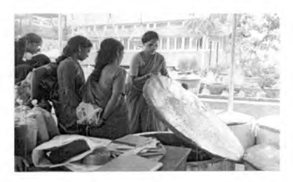
Institutional level Agroclinic on Vermicomposting technology for Kudumbasree women group at ABARD vermicomposting unit, Vellanikkara