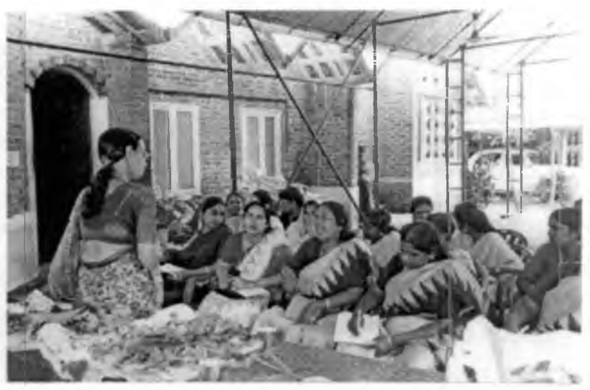
Field level Agroclinics conducted on flower arrangement and medicinal plants