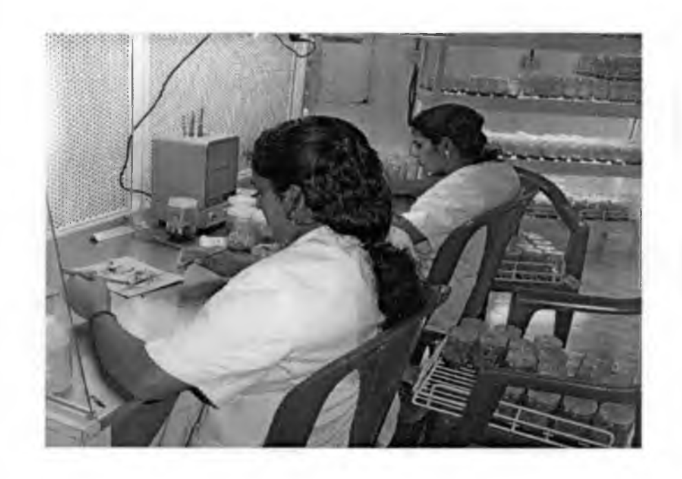
Nattika Tissue culture Laboratory