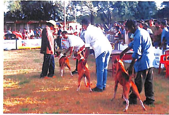
Pets get ready for the show