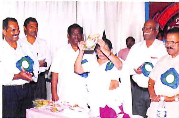
Smt. K.R. Gouri Amma releasing the Leaflet on Gramasree

Smt. K. R. Gouri Amma, Minister for Agriculture and Coir released a new strain of poultry, Grama Sree , developed by the Centre for Advanced Studies in Poultry Sciences, College of Veterinary and Animal Sciences, a leaf let explaining the qualities of the new variety, and a handbook of poultry production, on Feb. 23 evening.