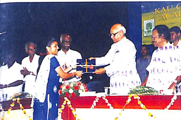
Shri.R.L.Bhatia, His Excellency the Governor of Kerala and Chancellor of KAU presenting the gold medals and certificates to the outstanding students of KAU

Though Kerala is endowed with favourable climate and environment, the agricultural production of the state could not achieve the desired target, said Sri.R.L.Bhatia, H.E.the Governor of Kerala and Chancellor of KAU. The Governor was presenting the gold medals to the outstanding students of KAU for their academic excellence in the undergraduate programmes of the university, in a glittering function held at the Central Auditorium of the University at Vellanikkara on Dec. 9, 2005. The Chancellor exhorted the teaching community to shoulder greater responsibilities to discharge their obligation to the new generation of students.