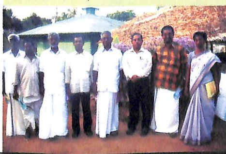
At the ATIC, Mannuthy