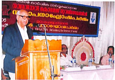
Sri. R.L. Bhatia, addressing on the Merrit Evening