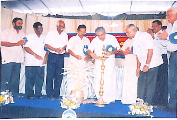
Sri. Vayalar Ravi, Union Minister inaugurates the valedictory festival of the golden Jubilee