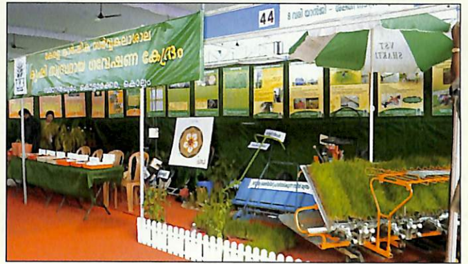
A glimpse of the stalls