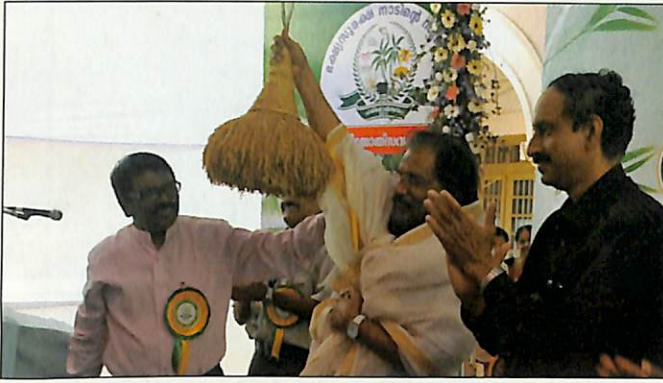
Padmabhushan Dr. K.J. Yesudas signifies food security