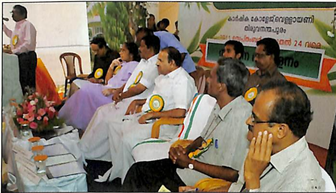
Valedictory Function in progress