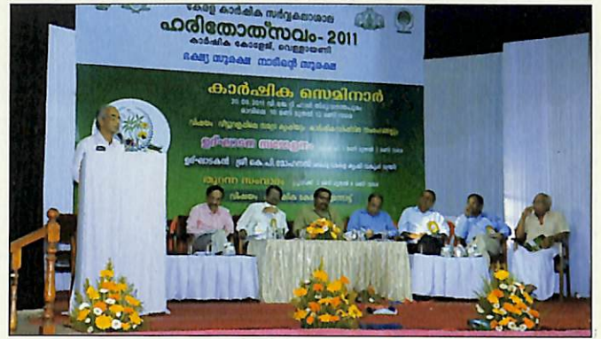
K. Jayakumar IAS inaugurating Symposium