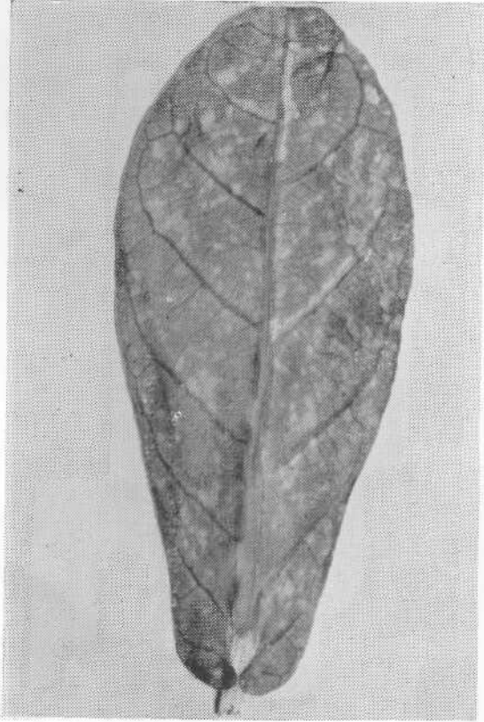
Fig. 1. Affected leaf.