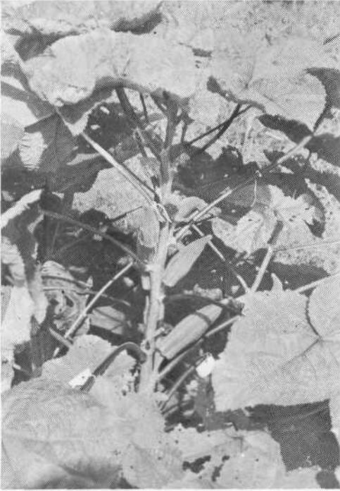
Fig. 1. Semi-wild form of okra

An okra form popularly known as "Thamaravenda" is widely occurring in a semi-wild form in Kerala. Its pods are edible and hence cultivated casually to a limited extent in the homestead. Morphological features of pods, epicalyx and leaves of this okra form are distinct in many aspects from the widely cultivated species Abelmoschus esculentus . This species form is a long duration crop having perennial nature (Fig. 1). It respond to ratooning and is fairly resistant to yellow vein