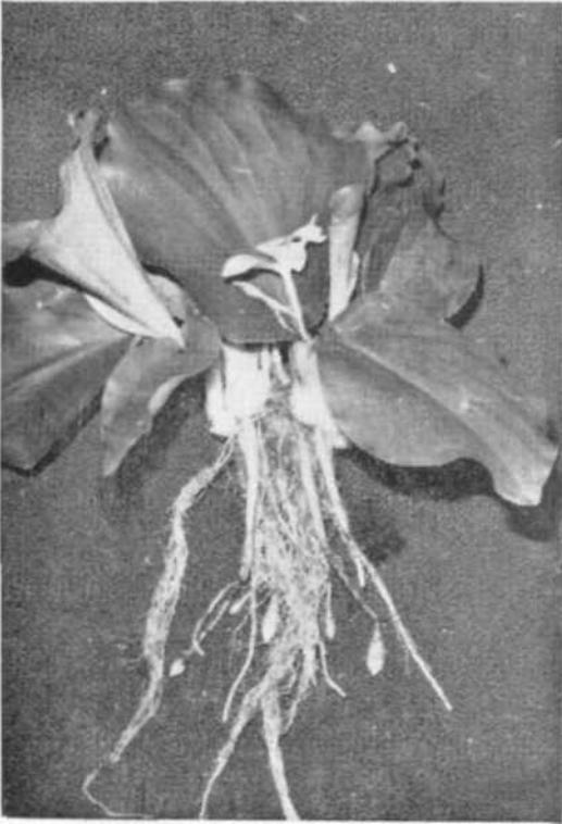
Fig. 1 Growth habit of Kaempferia galanga